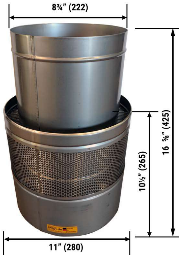
(Dimensions in parentheses are millimeters)

Below are the dimensions and the specifications for the WISY Smoothing Inlet: