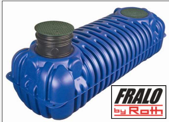
FRALO brand septic tank by ROTH Global Plastics, Inc.