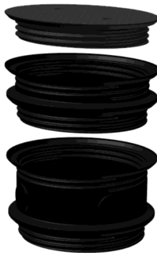
Roth Riser System STAR®